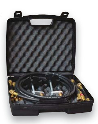
Optional Flushing Kit*