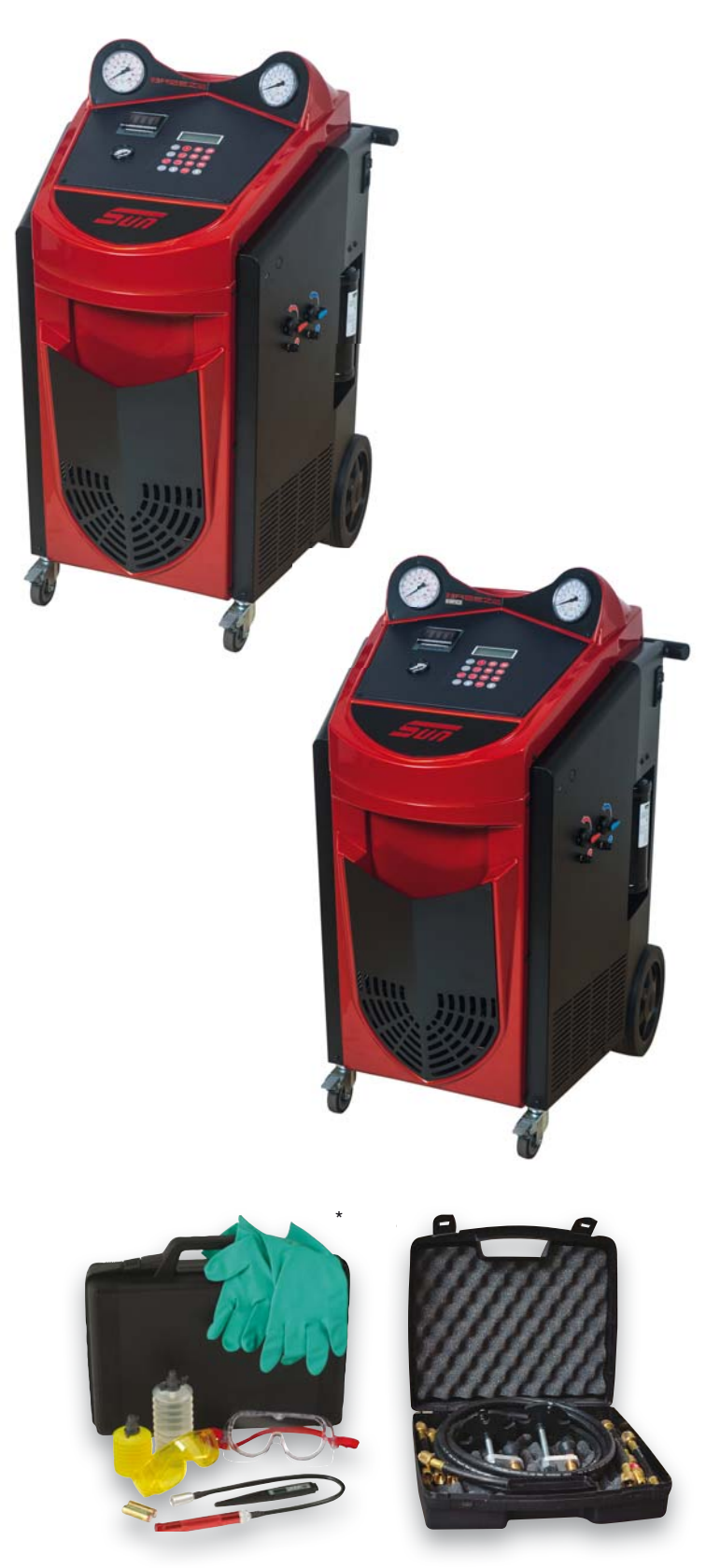
Optional Accessory Kit*