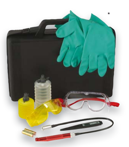
Optional Accessory Kit*