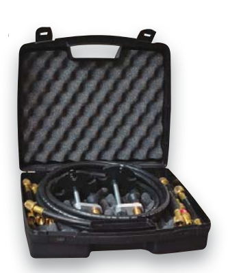
Optional Flushing Kit*