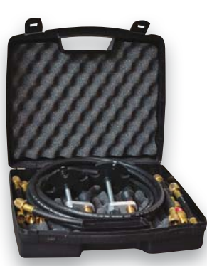
Optional Flushing Kit*