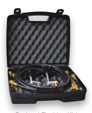
Optional Flushing Kit*